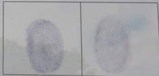
Left Thumb Mark