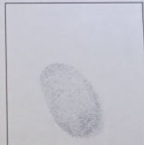
Right Thumb Mark

CTC. No. : _____ Place issued: _____ Date issued : _____ O.R. No. : 6071163