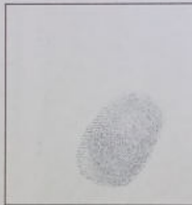
Left Thumb Mark