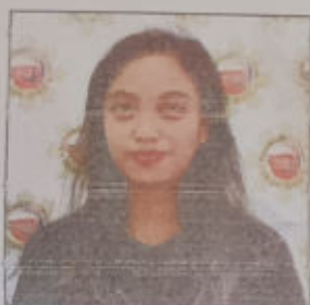
Date Taken: 03/17/2023