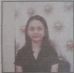
Date Taken: 11/21/2024