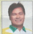
HON. WENCESLAO JOSHUA C. MURILLO Chairman - Committee on Infrastructure and Public Works