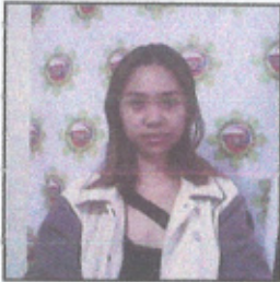
Date Taken: 04/03/2025