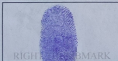
RIGHT THUMB MARK

This certification is issued upon the request of the above-named person to support for whatever legal purposes serve best.