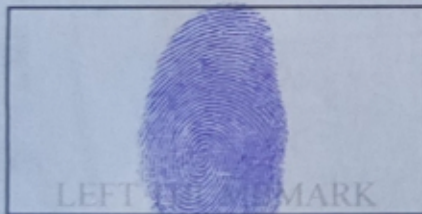
LEFT THUMB MARK